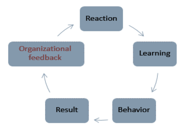
Figure 3: The Summary of Research

prominent model so far. In this study, in addition to the common methods of evaluating in-service courses which have been limited to surveying the participants and using questionnaires, based on the pattern of change in learning, the resulting behavior and outcomes of training the teachers were evaluated in their work environment and the areas which needed improvements were addressed in the study. One of the reasons for the importance of this study was planning to prevent wastage of organizational resources and interests by examining the quality of the provided trainings at different levels of evaluation; which means that according to the provided trainings, the evaluation levels and the conceptual research model, it turned out that if the teachers under training provide more responses, the learning will takes place better; and it will enhance the teacher's ability and skill, mastery, and performance, and it was found that the level of behavior has a positive impact on the teacher's organizational results and the productivity resulting from his performance. However, due to the time constraints of training courses and the presence of influential factors in organizational definitions and the researcher's inability to make organizational decisions to create a competition and rank the teachers' activities, upgrading the conceptual model and turning it into an evaluation cycle did not become possible.